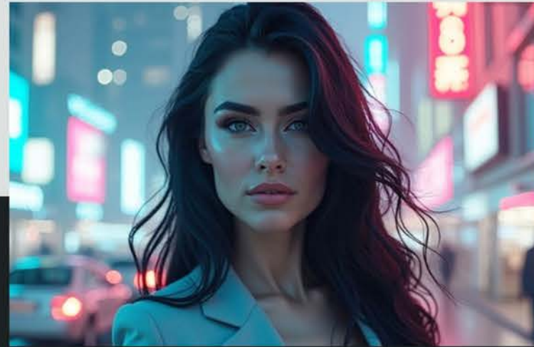
STELLA VATTA CONSTANTIN

Age 22, 5'8", Captain, Mediterranean heritage, athletic build, brown hair, brown eyes. Disgraced and hounded by the media, Ky's father, Gerard Vatta, decided that the best place for her was a simple mission for her maiden voyage as a Captain.