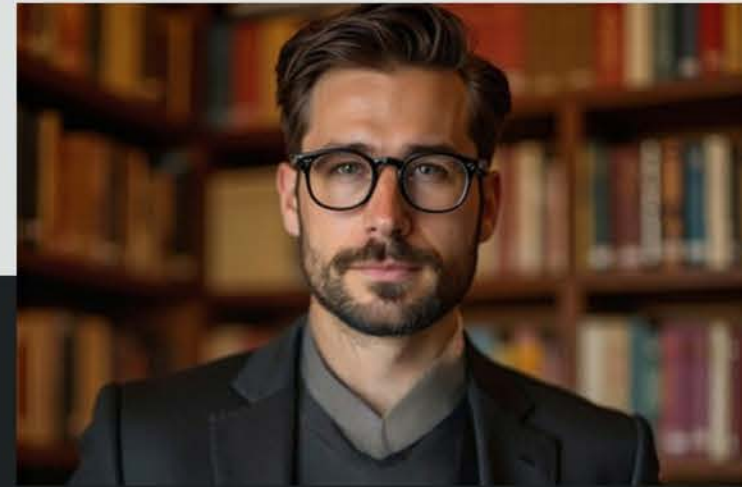
RAFE STONER MADESTAN

Age 28, 5'9", G2, Mediterranean heritage, athletic build, brown hair, brown eyes. Stella has undertaken numerous missions for Vatta, which is how she met Rafael Stoner Madestan. She is smart, secretive, conniving, and a master at disguise.