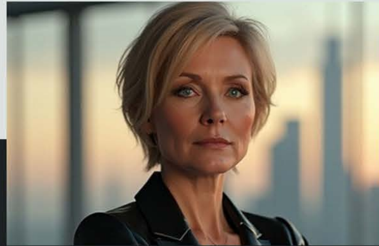
GRACIE LANE VATTA

Age 24, 5'6", Senior Navigator - Sheryl is a natural at navigation. She joined Vatta at 20 right out of Nav School and she's already a senior navigator in the fleet. She may be planet born, but she is an adept navigator.